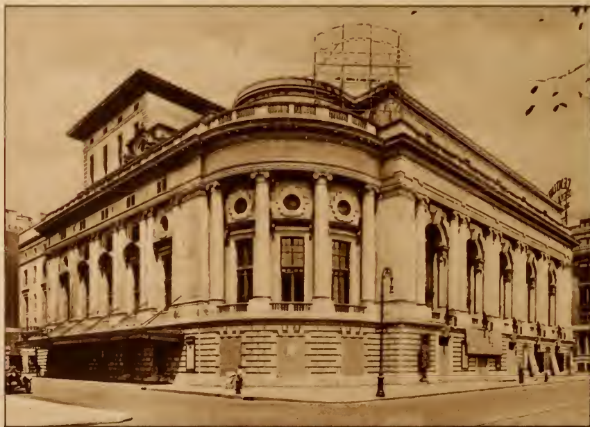
CENTURY OPERA HOUSE, 62nd Street and Central Park West.